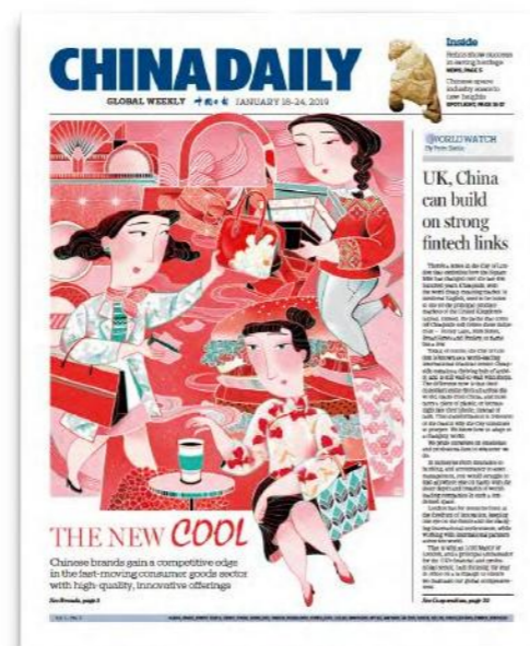
China Daily Global Weekly