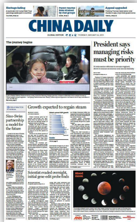
China Daily Global Edition